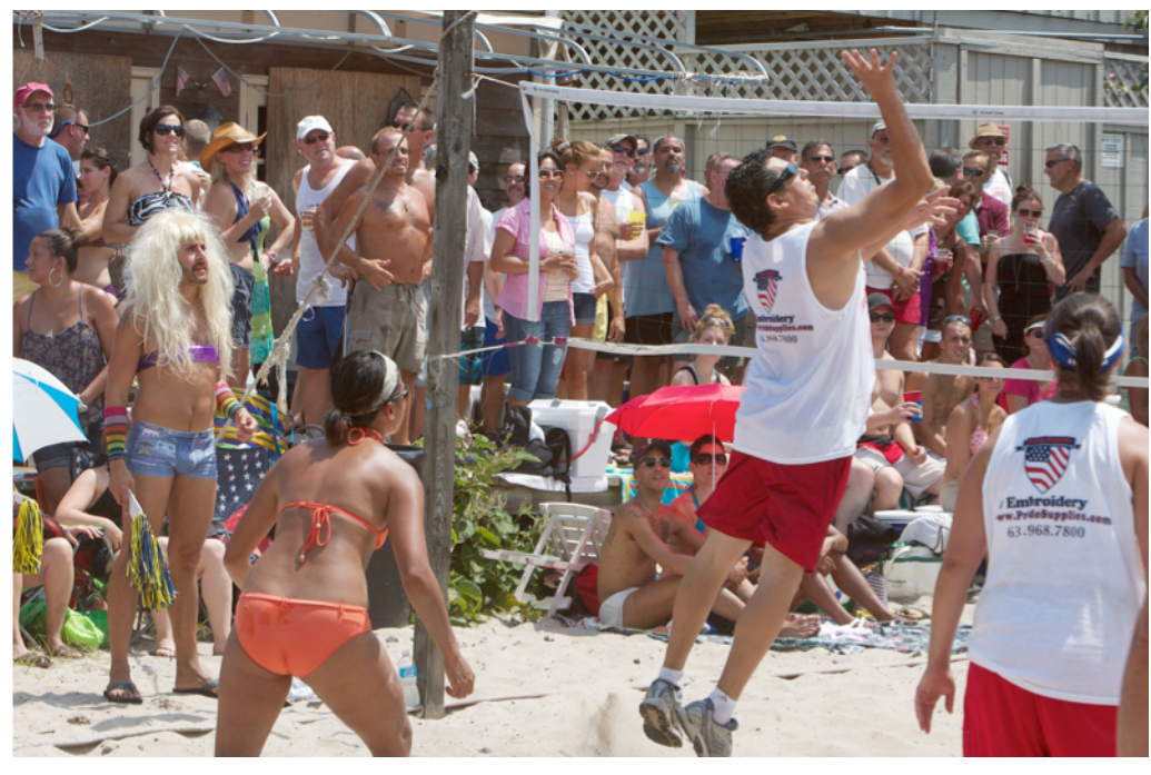
The Cherry Grove Volleyball Team...the Grovettes...took on the Copettes for the annual meet. The Grove lost for the first time in fifteen years...got to keep them interested! Lots more photos at TheVioletLetter.com! Look for yours!